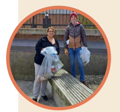
The Plaza Halifax, Nova Scotia