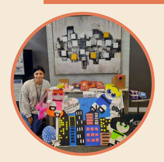
Bonaventure Estates Calgary, Alberta

Our communities across Canada organized a variety of events and activities to honour Earth Day.